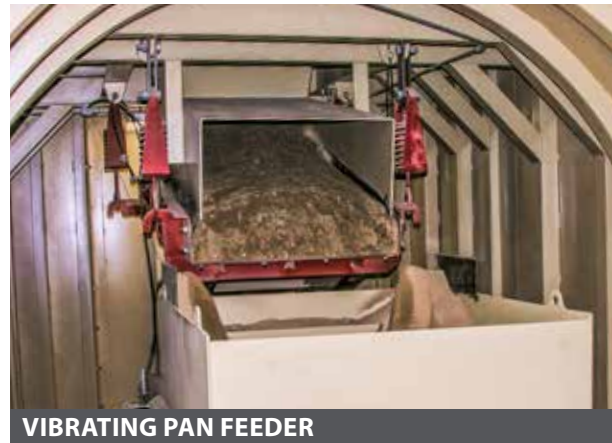
VIBRATING PAN FEEDER