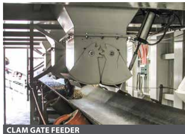
CLAM GATE FEEDER